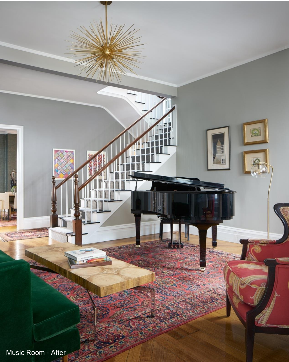
Music Room - After