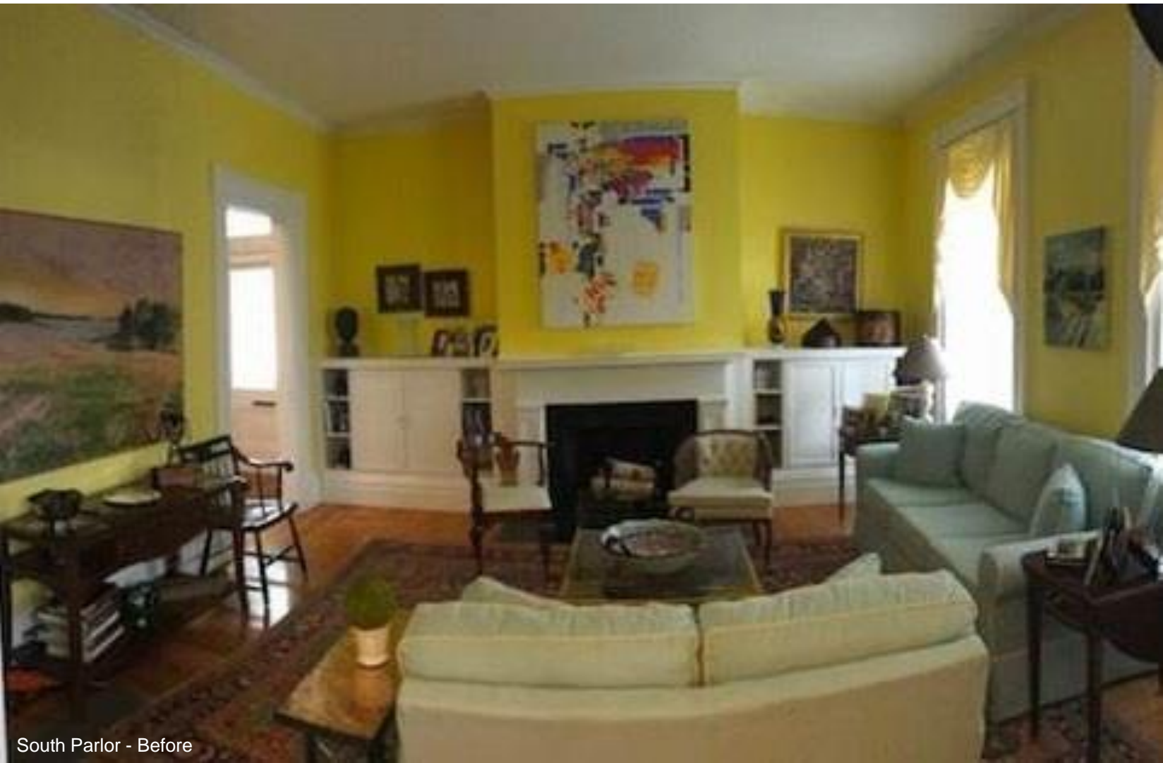
South Parlor - Before