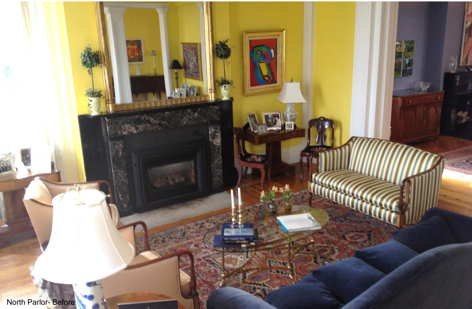
North Parlor- Before