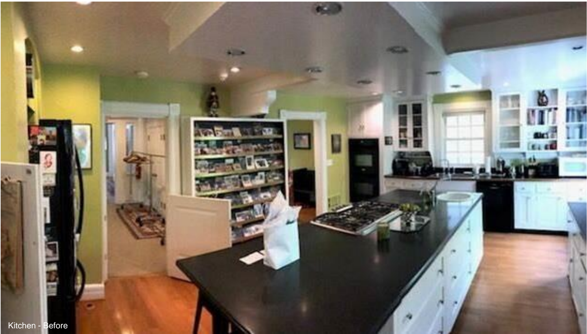
Kitchen - Before