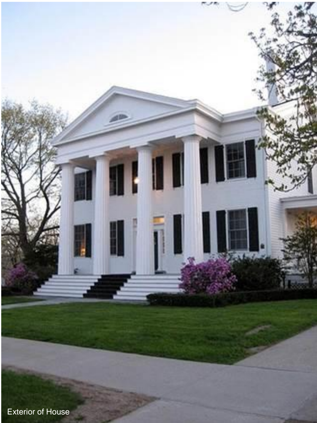
Exterior of House