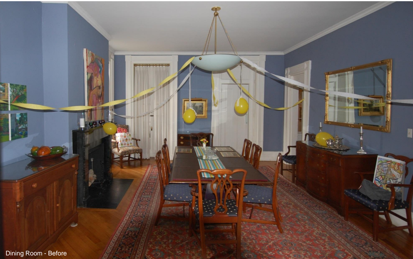
Dining Room - Before