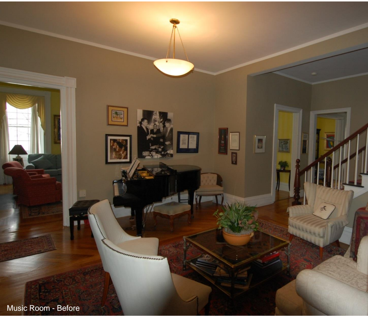
Music Room - Before