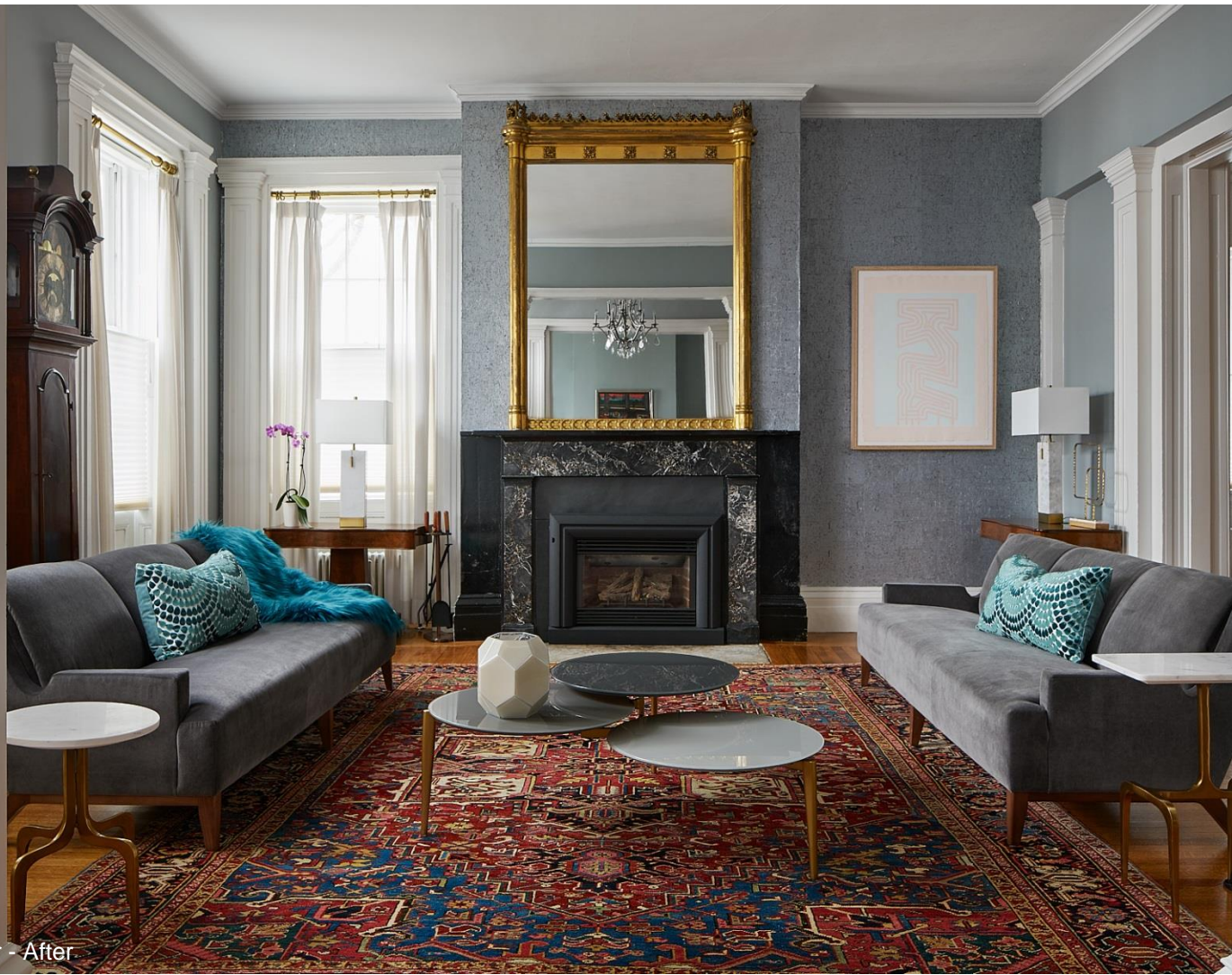
North Parlor - After