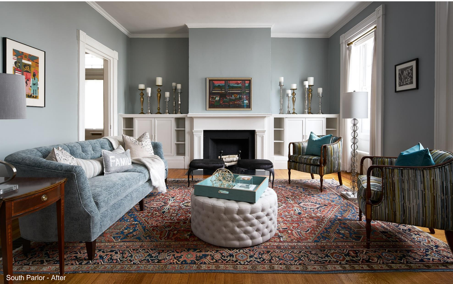
South Parlor - After