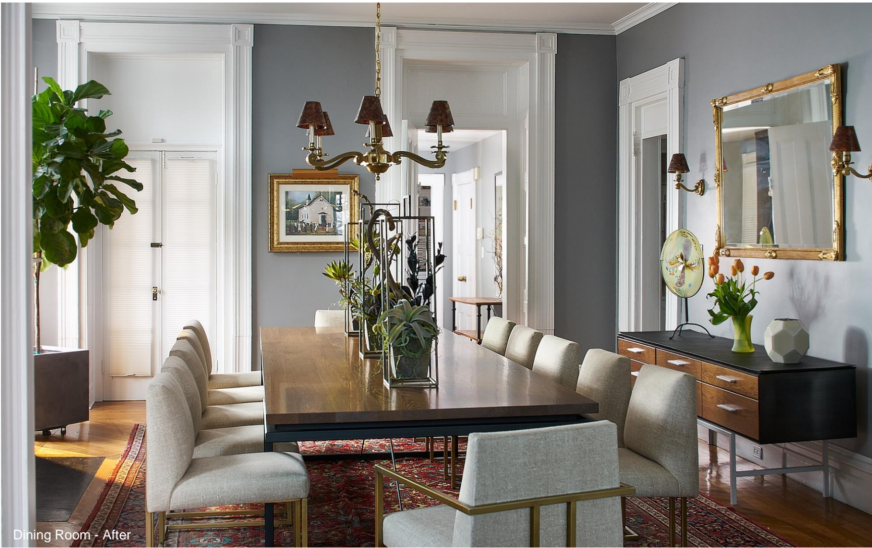
Dining Room - After